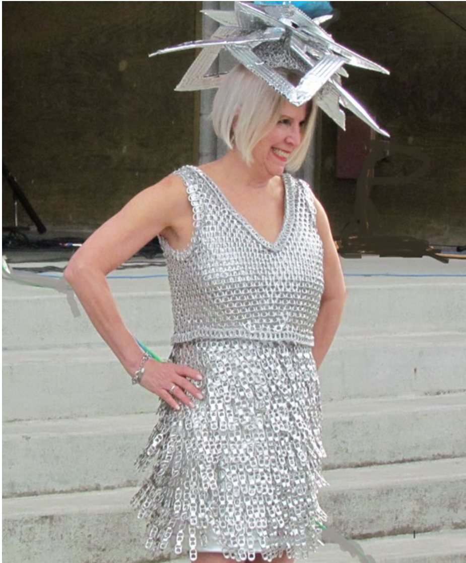
Example: Trashion dress made from Aluminum pop can tabs, hat metalized plumping insulation