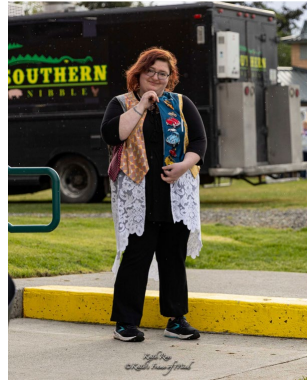
Fun Example 2

Functional creation made from a coffee bean sack, old sheet, and a man's dress shirt