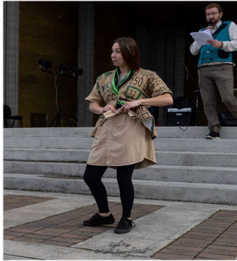
Unique Example 1

Functional creation made from a coffee bean sack, old sheet, and a man's dress shirt