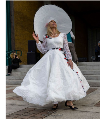
Authentic Example 4

Trashion gown made from pop can pull tabs, picture wire and reel tape